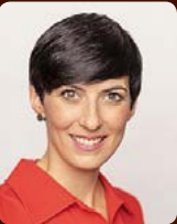
Markéta Pekarová Adamová (TOP 09)